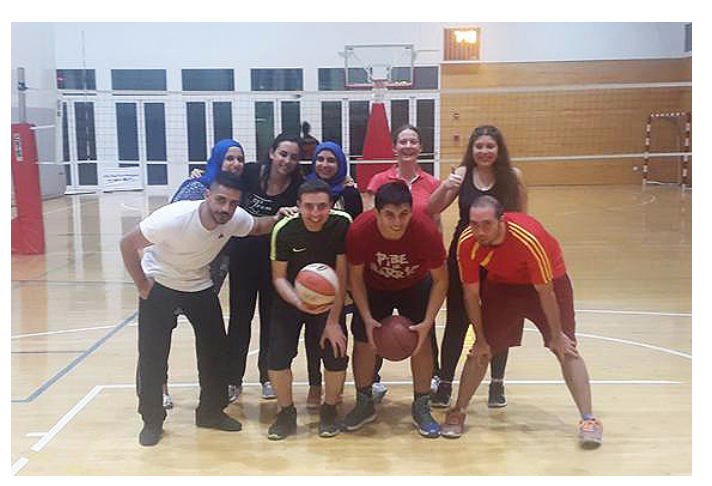
Pediatric residents arranged a basketball game after duty.