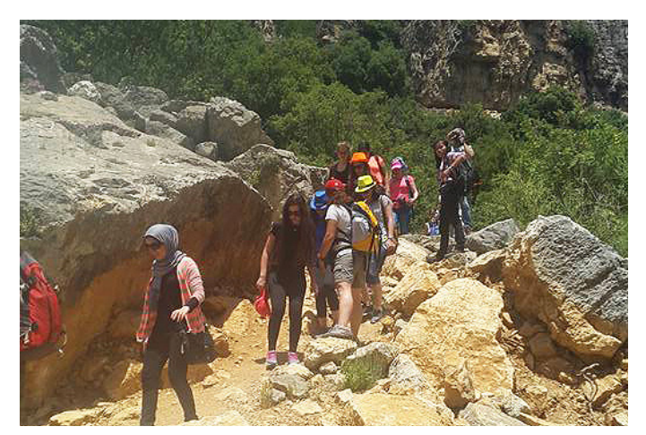
Pediatric residents organized a hiking trip in Mazraa't El Shouf.