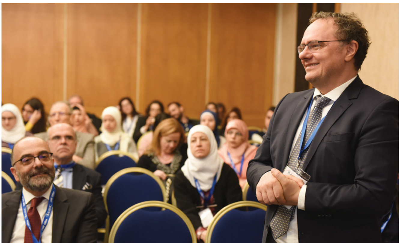
From the “Practice Guidelines in Obstetrics and Gynecology Symposium” that was held on March 9, 2019

OB/GYN Wire is published quarterly by the Department of Obstetrics and Gynecology at AUBMC.