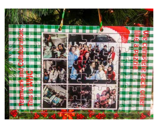
Specialty Clinics OBS